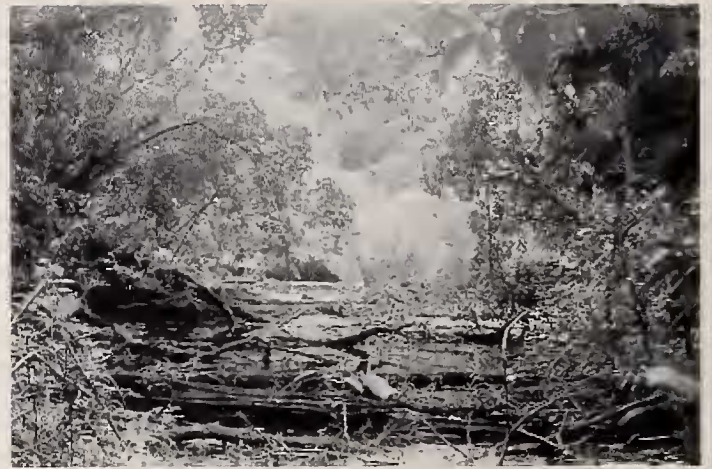
FIG. 2. Brackish water swamp habitat of A. andamana at Little Andaman. A freshly emerged female moth was collected from the over hanging branches of Ficus ?retusa on the left of the picture.

brown bands encircling the eggs. Inner surface pale brown, smooth and highly reflective. The eggs were laid singly or in batches of 2 or 3 on the ventral surfaces of leaves. Some were laid about 1 cm apart while others were laid in contact with each other.